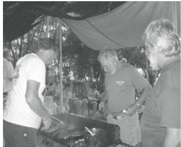
- cookin' those ribs!

Yours host would like to thank all who helped to make this a most memorable cruise. All assistance provided from dinghy, cooking, to ferry service is greatly appreciated. The faces and names are many and you know who you are. In addition the names of the vessels in attendance are numerous, so as not to miss any and protect the names of the innocent they were not included. May the seas rise up to meet you and the wind be at your back.